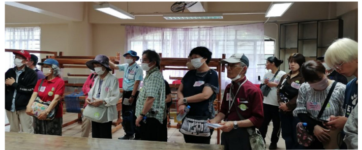
PEACE BOAT participants visiting the DAWN-TUP Training Center

DAWN’s Teatro Akebono presented a play that shares their experiences as women migrant returnees and the challenges they faced here and abroad. The participants of the exchange also had a walkthrough of the DAWN-TUP Training Center, where some of DAWN’s sewing, weaving and special machines were housed.