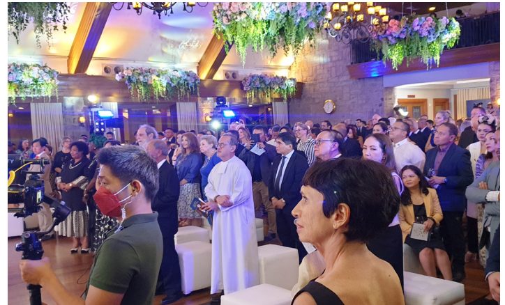
Guests from the diplomatic corps, government, academe and private sector gather as they prepare to celebrate the coronation of King Charles III with a toast.