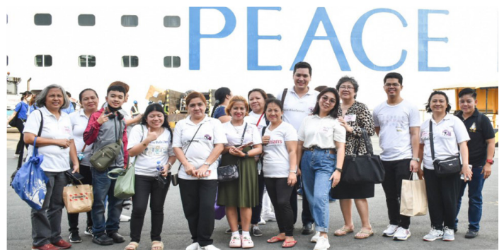
DAWN women and staff sending off the PEACE BOAT participants at the Cruise Terminal of the Manila South Harbor.

To cap the day’s activities, the DAWN team also sent off the PEACE BOAT participants at the Cruise Terminal, Port Gate 1, Manila South Harbor.