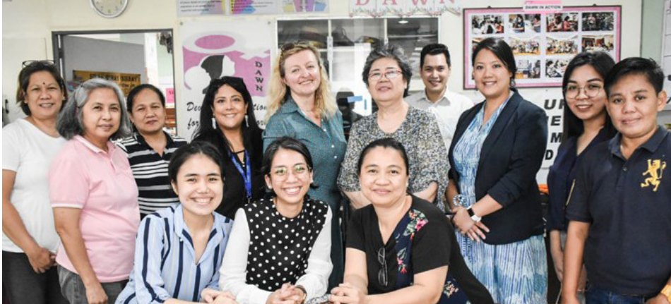
The DAWN women and staff with IOM representatives from the Philippines and Washington DC on May 23, 2023 at the DAWN Office.

Officials of the International Organization for Migration (IOM) visited DAWN on May 23, 2023.