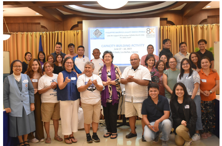
DAWN joins the Capacity – Building Activity of the Philippine Migrants Rights Watch (PMRW) with fellow PMRW member organizations on June 17 – 18, 2023 at Splash Oasis, Los Baños, Laguna.