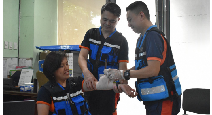
BFP team demonstrating on how to properly bandage a specific injury/wound during the First Aid Training.

The BFP team discussed on the first half of the First Aid training about Cardio-Pulmonary Resuscitation (CPR) and proper chest compression. The team also demonstrated the proper methods in doing CPR and proper chest compression in various situation. The second half was the discussion on the kinds of wounds, types of burns, heat exhaustion, bone fractures and how to immediately respond to these.