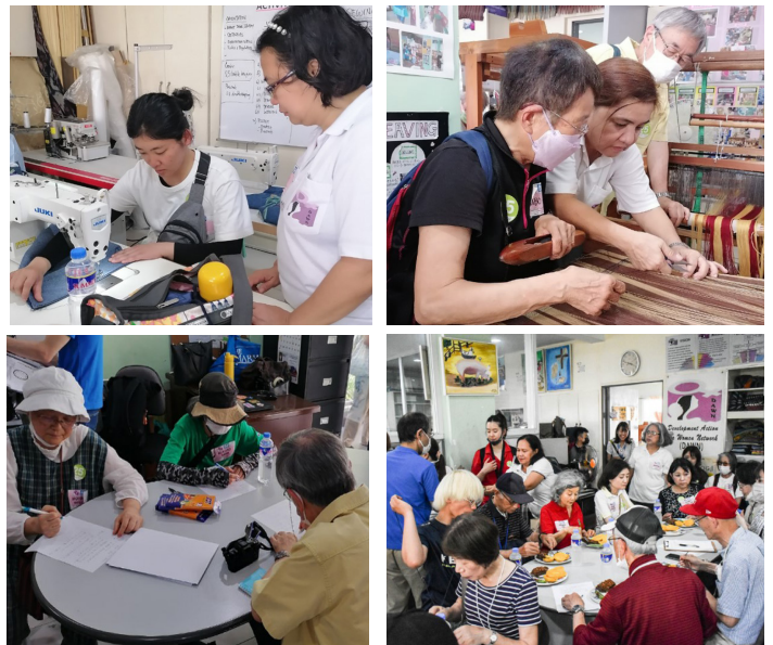
PEACE BOAT participants engaging at various interactive activities with the DAWN women and staff during their visit at the DAWN Office.

The PEACE BOAT participants also visited the DAWN office and participated in various activities: hands-on sewing & handloom weaving, interactive session about DAWN’s history & advocacy and post-event evaluation. All of the participants had a salu-salo of a Philippine merienda consisting of rice cakes and mangoes.