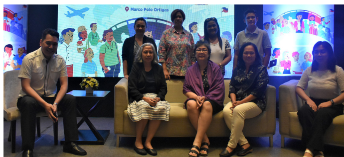
The DAWN women and staff at the BRIDGE Fair on June 16, 2023 at the Marco Polo Ortigas.