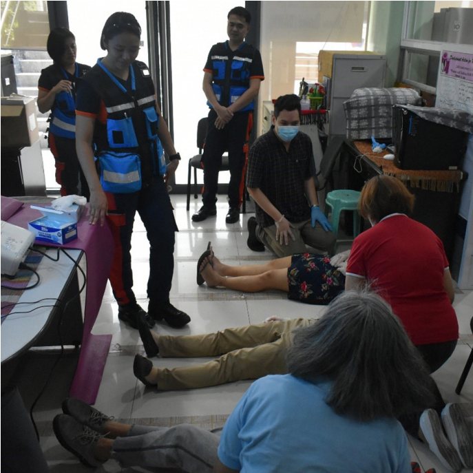
DAWN staff and trainees undergoing First Aid Training on Cardio-Pulmonary Resuscitation (CPR) by the BFP team.

DAWN conducted First Aid Training for its staff and trainees on May 30, 2023, in partnership with the Bureau of Fire Protection (BFP), and Disaster and Mitigation Management Seminar on June 14, 2023 with the Department of Social Welfare and Development (DSWD) – National Capital Region (NCR) at the DAWN Office.