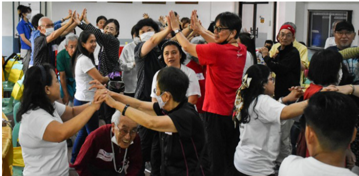
The participants enjoying the interactive Bahay, Tao, Bagyo ice breaker activity.