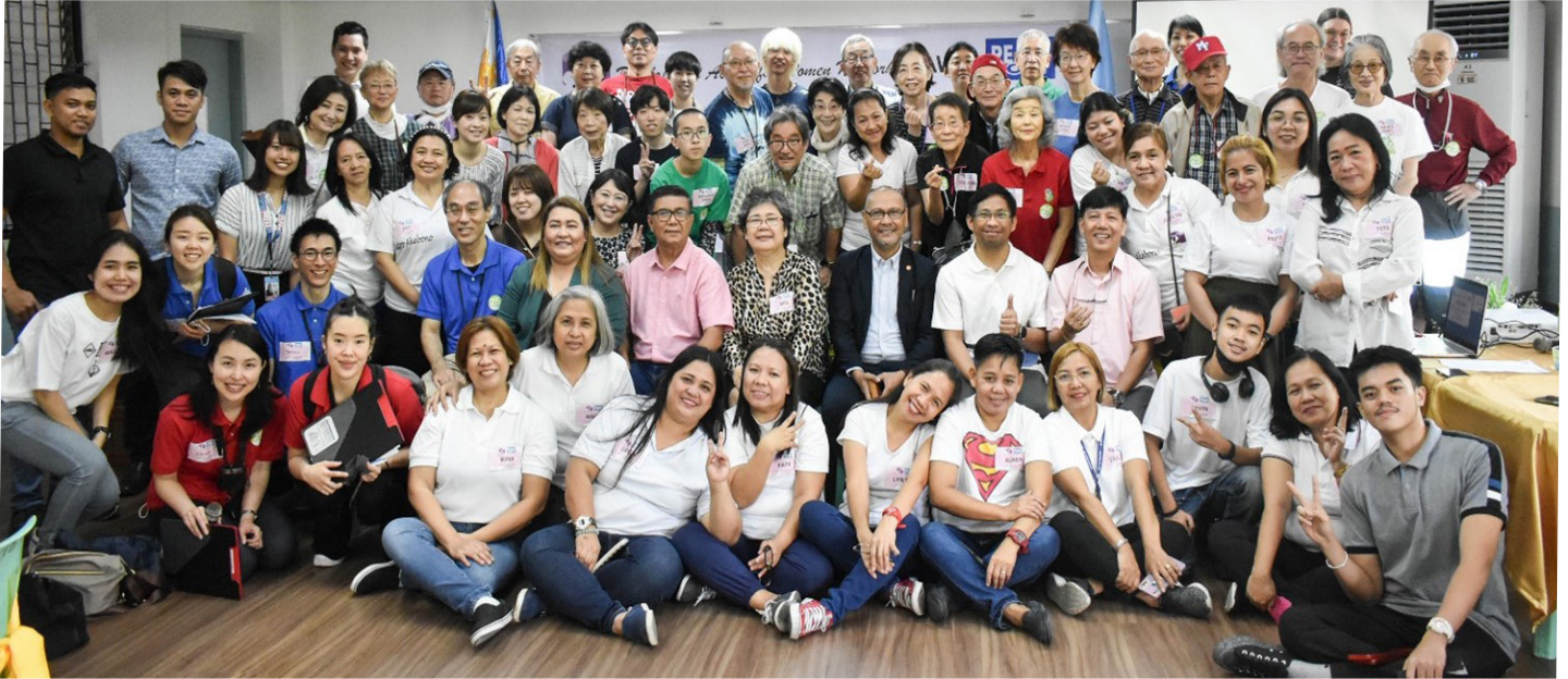
Participants, staff and guests during the DAWN-PEACE BOAT Exchange activity on April 15, 2023 at TUP-Manila.

The Development Action for Women Network (DAWN), in partnership with PEACE BOAT, conducted its Exchange Activity on April 15, 2023 at the Technological University of the Philippines – Manila and the DAWN Office.