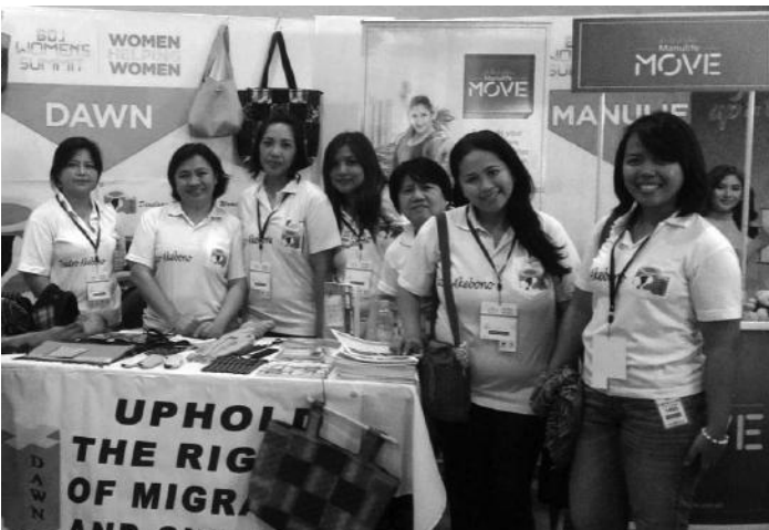
The DAWN women at the Belle De Jour 1st Women Summit

These seminars are: The Department of Science and Technology – Philippine Textile Research Institute’s (DOST-PTRI) Conference entitled “Tela Nation One ASEAN: Beyond Borders, Beyond Boundaries, Beyond Bounds” on January 28, 2016 at the DOST Executive Lounge; Entrepreneurial Management Seminar for Women Migrant Returnees on March 12-13, 2016; Filipino Women Suffrage in the Philippines on April 29, 2016, Capacity Building Training on Women Migrant Workers Rights and Migrant Advocacy on April 22-24, 2016, Belle De Jour 1st Women Summit “Women Helping Women” on April 16, 2016; Organizational Development Seminar on April 9-10, 2016, NCCA Vietnam Cultural Days in the Philippines on July 13, 2016; 2nd National Conference on Migrant Health on July 17, 2016 and Women and Youth Leadership Training on August 6-7, 2016.