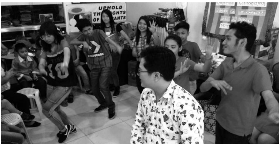
DAWN's Youth group with their Hip hop dance