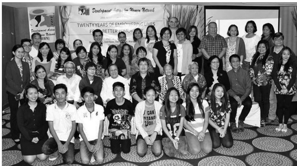
DAWN’s 20th Anniversary at Bayleaf Hotel, Intramuros, Manila on February 6, 2016.

From the 41 children/youth members of DAWN, twenty six (26) are female and fifteen (15) are male. As for their educational level, five (5) are college graduate and now working, one (1) is completing Medicine Proper, six (6) are in college, one (1) High School graduate and working, sixteen (16) in Junior High School,