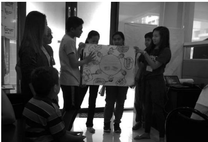
PAAC groupwork presentation with the JFC at the DAWN office