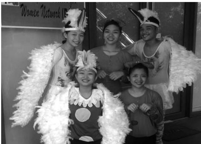
2016 Cast of The Crane Dog

All throughout the year, Japanese students from various universities, groups and individuals visited DAWN as part of their study tour. These students and other guests were provided orientation on the programs and services of DAWN and were given the chance to interact with the women and JFC members.