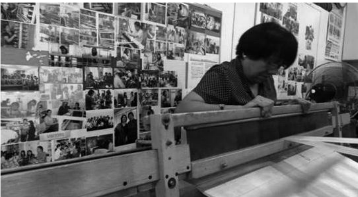
Zeny weaving coasters, the last step in the hand-weaving training.

“Training is not only gaining the skills but also bonding, learning, dreaming together and gaining friends,” the trainees shared during the evaluation.