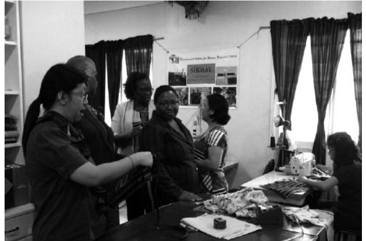
Jamaican delegation's visit to PMRW, DAWN and Sikhay's sewing and weaving projects on October 12, 2016

Enable Kids Project in Hamamatsu Japan last Sept 21-26,2016; VV100: A Strategic Gathering and Retreat on October 10-15, 2016 at the Ritz-Carlton, Half Moon Bay, San Francisco, California, USA; 9th ASEAN Forum on Migrant Labour on November 9-10 at Ventiane, Lao PDR. and the Global Forum on Migration and Development (GFMD) on December 7-10, 2016 in Bangladesh.