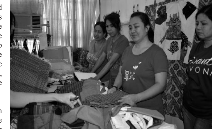
Yoshida Seminar students discussing with Sikhay members

The study tour ended with a dinner, sharing of each other's lives and experiences, and group photos.