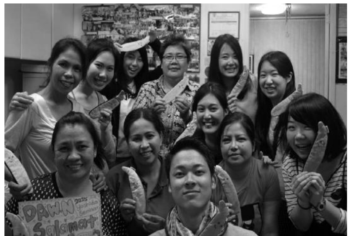
Yoshida Seminar students with Sikhay members showing banana pen cases designed by them