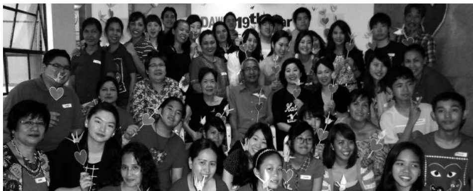
The DAWN Family with Study Tour participants during DAWN's 19th Anniversary

The DAWN women and children, volunteers, staff and Board of Trustees (BOT) cheered as they saw themselves in the video feeling happy and grateful to be part of the DAWN Family.