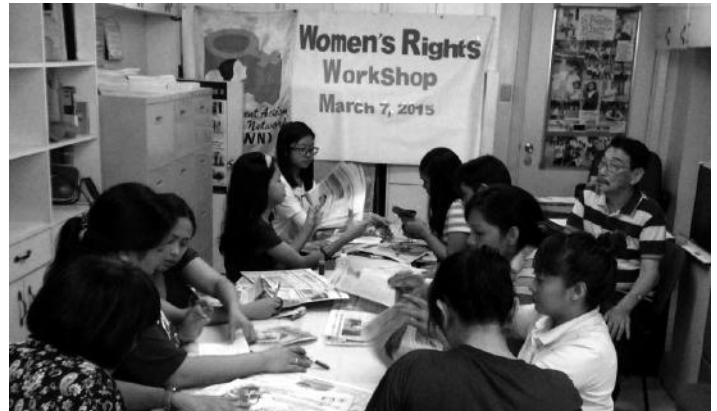
Women and children preparing materials for their collage