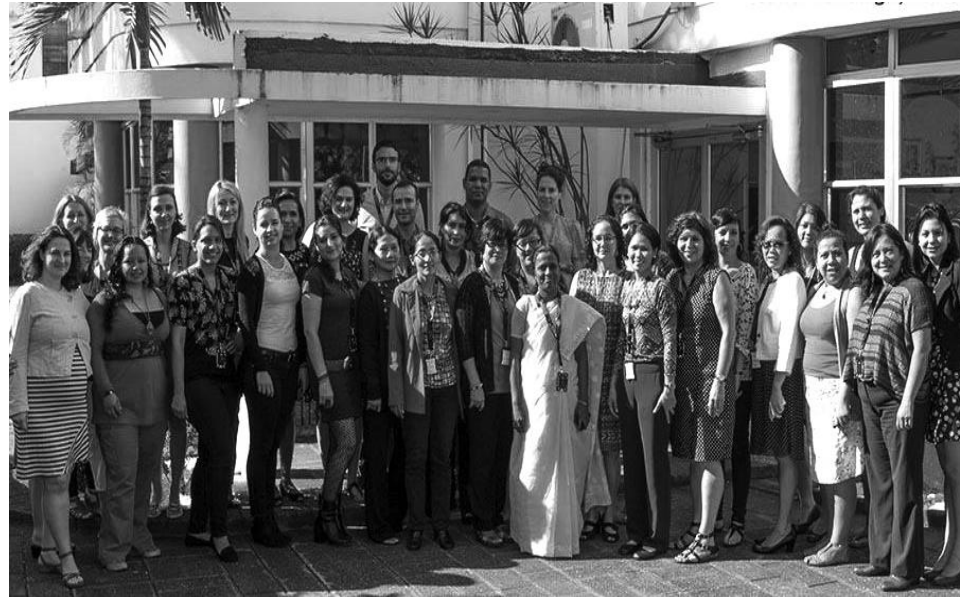
Participants of the UN Women workshop

She is also the author of the Training Manual “Gender on the Move: Working on the Migration – Development Nexus from a Gender Perspective.”