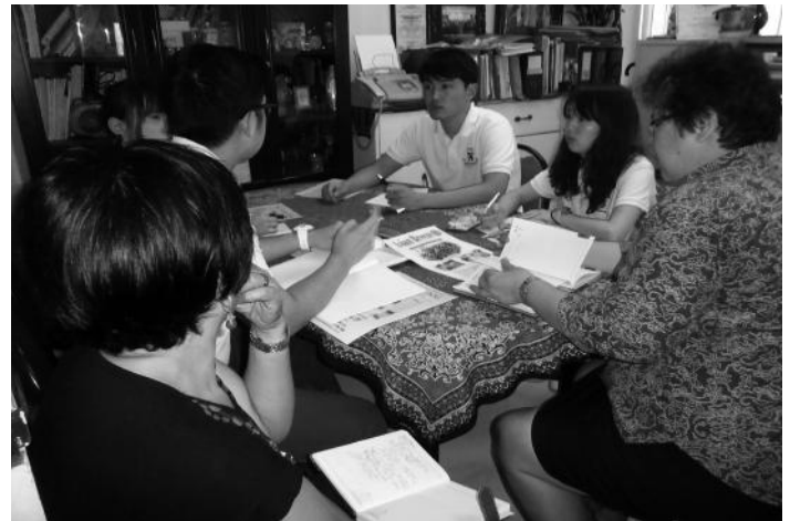
Mayumi Seminar students discussing DAWN's Theater Tour in Japan from May 16 to 31, 2015