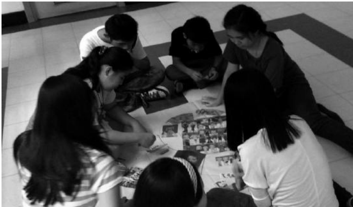
Japanese-Filipino Youth preparing for their presentation

The participants claimed that knowing and understanding their rights also mean being responsible in following rules governing these rights. It is more fun and learning is facilitated when other sectors join in understanding and have better access to these rights. It resulted to a deeper relationship between the mothers and their children.