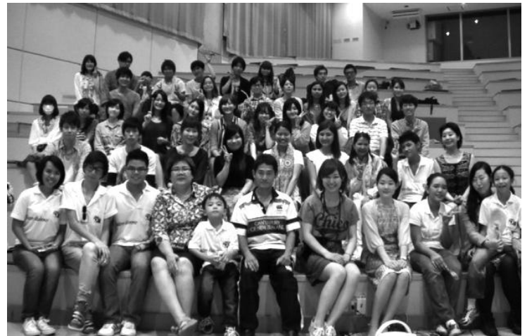
DAWN-YNU Group Photo

It was a perfect opportunity for pictorials. Then the group was brought to the Yonohonmachi Center where they cooked Filipino dishes for their Japanese friends.