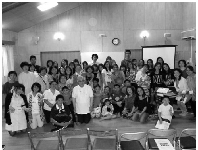
At the Kousouji church in Nagoya after their presentation

So much food and drinks were enjoyed by everyone including the discussion while having dinner. Sikhay products were patronized by the attendees.