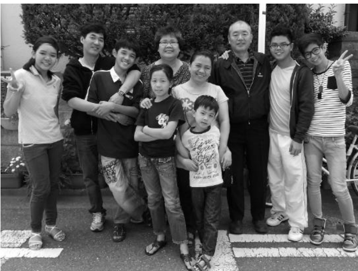
DAWN staff and JFC with their fathers in Saitama

After the activity, a dance-farewell party was held for team Akebono. Everyone danced and enjoyed the party that ended quite early.