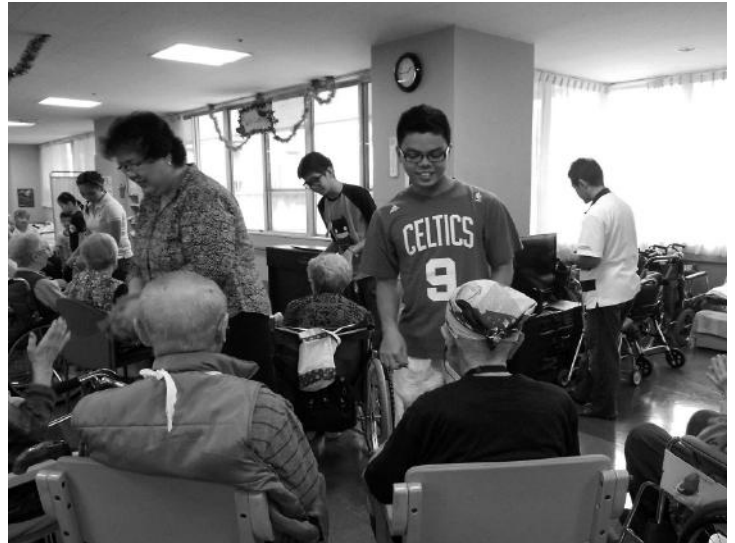
At the Makoto Center with the elderly

Teatro Akebono presented their play. A number of people from the audience asked questions to the JFC performers.