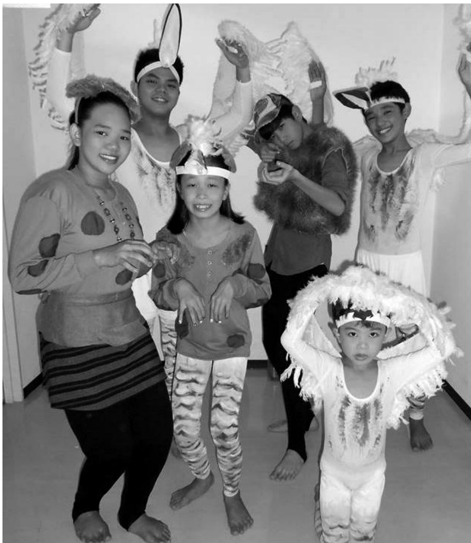
Cast of "The Crane Dog"