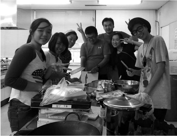
Preparing Filipino food for dinner with friends