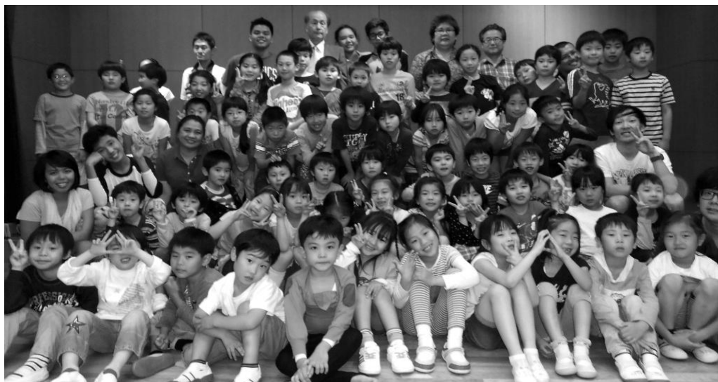
With the children at the Makoto Center

The following day, the team traveled to Yokohama.