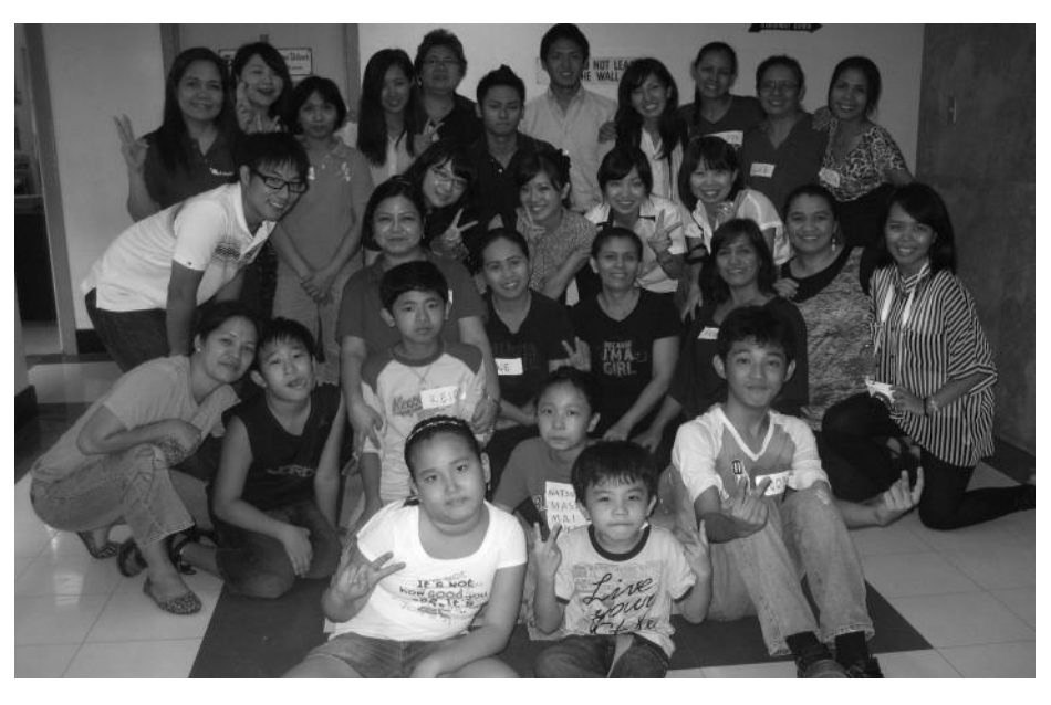
Kansai University students with DAWN women, JFC and staff