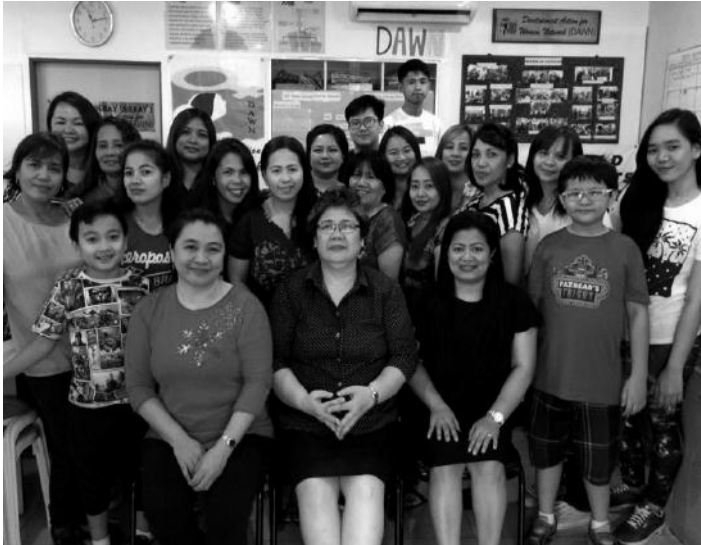
The DAWN family celebrating International Women’s Day

DAWN joined the celebration of National Women’s Day by conducting a workshop for women and children/youth on March 11, 2017. The game “Bring Me” set the tone of the activity followed by a group work.