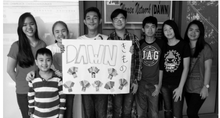
The JFC with their Kimono Art