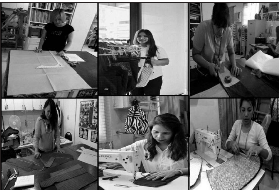
The DAWN women making patterns, cutting and sewing their bags with their own designs.

of March (women’s month) on the issue of women empowerment, OFWs, migration and self expression through fashion. On March 8, International Women’s Day, the LAV posted the articles about the women, DAWN’s work and women’s empowering stories and fashion.