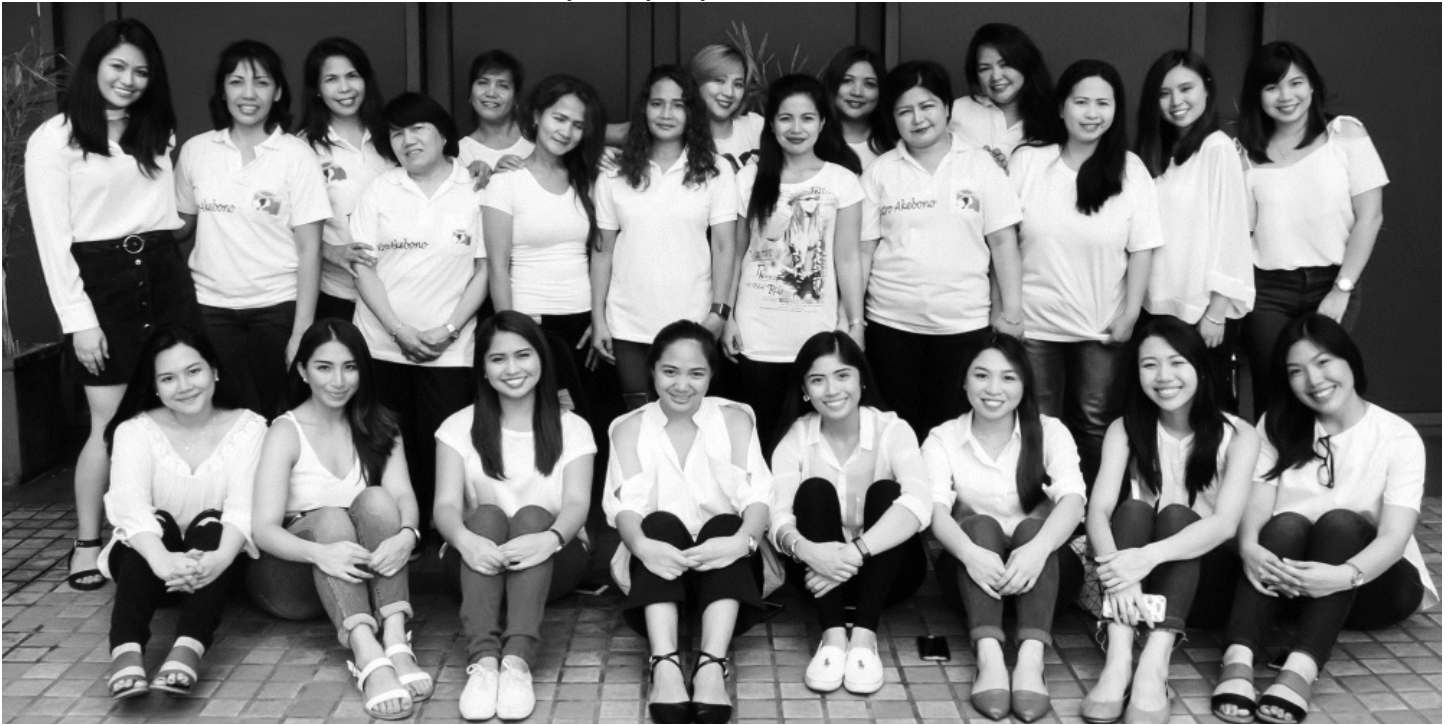
The DAWN and LAV women during the photoshoot and interview on February 25, 2017.

The DAWN and the Lex Athenia Victoria Society of Women of Law (LAV) of the Ateneo de Manila University collaborated on the project with the theme “Resonance: Celebrating Self-Empowered Women.”