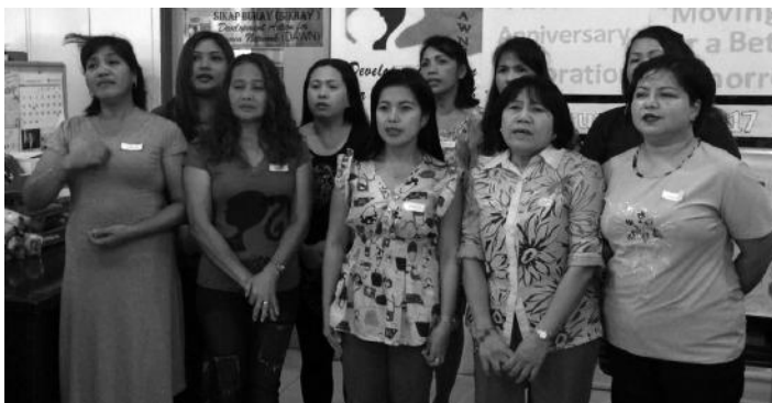
DAWN women rendering a song to the audience.