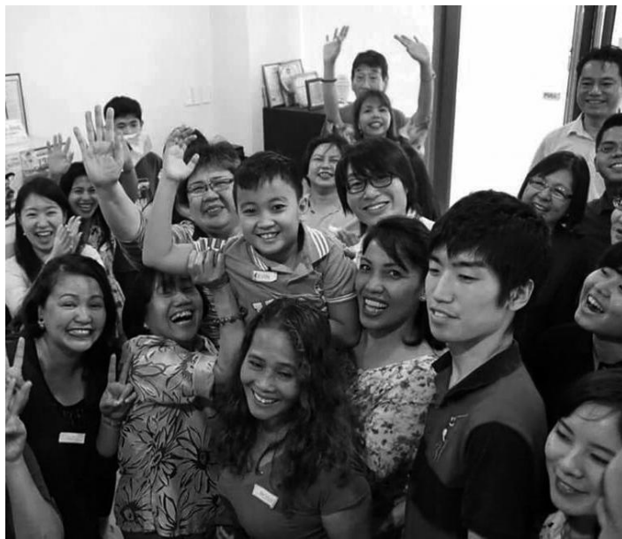
The DAWN family cheering at the anniversary

DAWN had its get-together lunch with its members and the students from Kansai and Kyoto University. There were also raffles and games during the celebration of the 21st anniversary of DAWN.